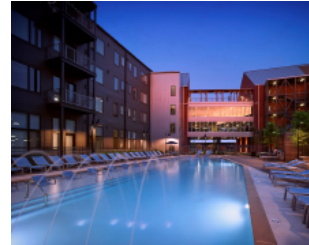
Multifamily Nashville, TN

Eaton Vance Management, a wholly-owned subsidiary of Eaton Vance Corp., provides investment advice to its fund clients concerning real estate transactions. As a matter of policy, Eaton Vance Management does not disclose which fund or funds buys or owns a specific property. This is not an offer to sell shares of any Eaton Vance fund nor a solicitation of offers to buy or sell shares of any Eaton Vance fund.