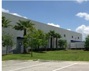
Industrial Orlando, FL