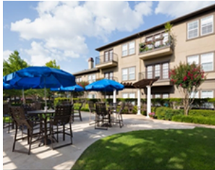
Multifamily Dallas, TX