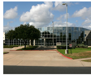
Office Austin, TX