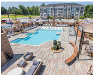
Multifamily Raleigh, NC