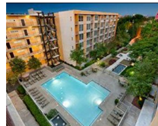
Multifamily Atlanta, GA