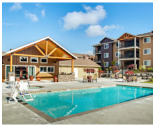
Multifamily Vancouver, WA