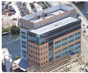
Office Miami, FL