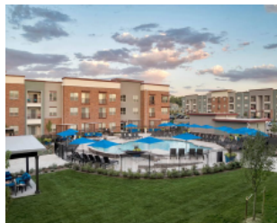
Multifamily Denver, CO