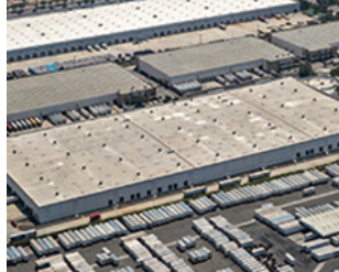
Industrial Inland Empire