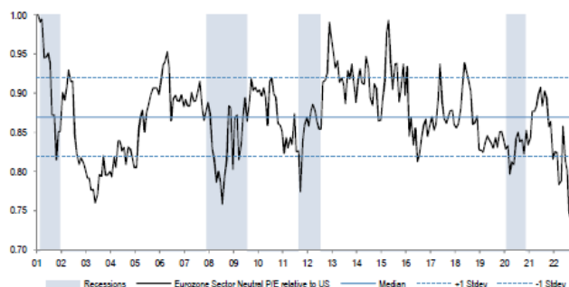
MSCI Eurozone sector neutral P/E relative to U.S.