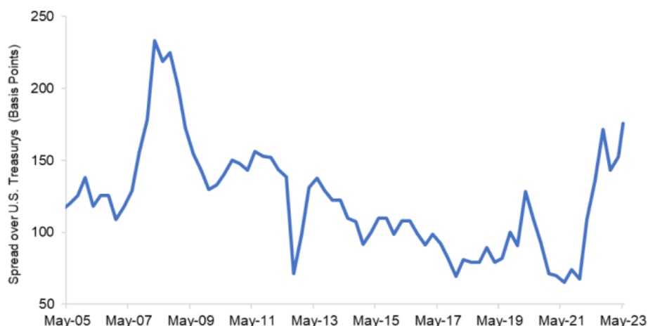
Attractive pricing in agency MBS

In our view, an investor trying to navigate the curve and avoid that credit risk should consider the U.S. government agency MBS market. At present, the market is trading at what we believe are extremely attractive levels. Spreads today are 179 basis points (bps) over U.S. Treasuries in the par coupon bond and close to 200 bps over for higher coupon bonds. By comparison, spreads were only 60 bps over Treasuries two years ago.